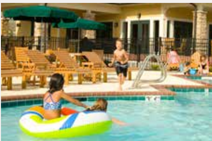
Pool and Clubhouse

walking trails, access to major road systems, thriving business and entertainment options, and community amenities now underway, provide our residents a proud place to call home.