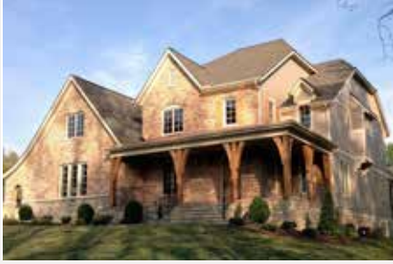
Bel Arbor Builders