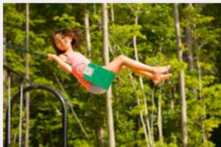
Playground and Park