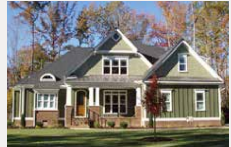
Falcone Custom Homes