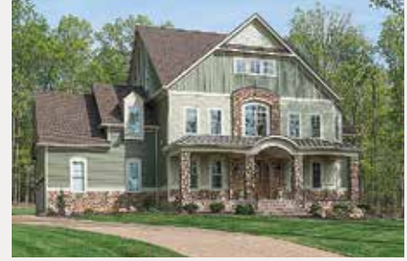
Creative Home Concepts