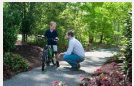
Over 3 Miles of Trails